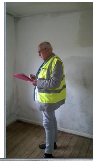
Tenant Void & Repairs Inspectors out on side inspecting a void property